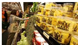
This is how much it actually costs to shop at Whole Foods MarketWatch