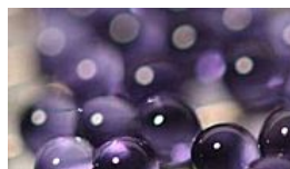
Could these tiny beads be the solution to stopping CO2 emissions? Cleanleap