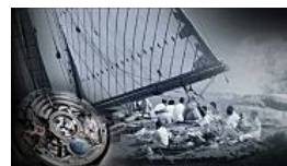
Luxury's 25 Most Innovative Brands: Ulysse Nardin Robb Report