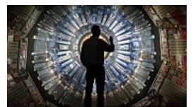
10 amazing things technology will bring us sooner than you think MarketWatch